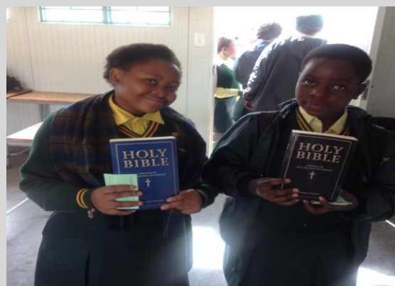
(Students receiving Bibles)