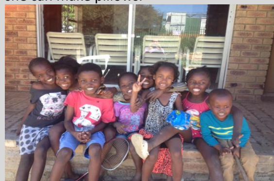
(Chilling at the Mission station)