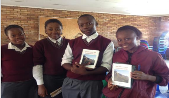
(A few students receiving their New Believers Guide)

answer questions correctly from the previous Bible Study. It is usually a big occasion when they get the answers right! Since I started two years ago, I have finished the 42 Bible studies in my book with two schools in Tembisa. Two other schools are on Lessons 22, and two other schools are at lesson 10. This book can be downloaded from this website www.interethnicmissions.net free of charge. Go to Word Studies: Books.