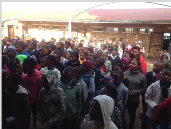
Learners hearing the gospel!