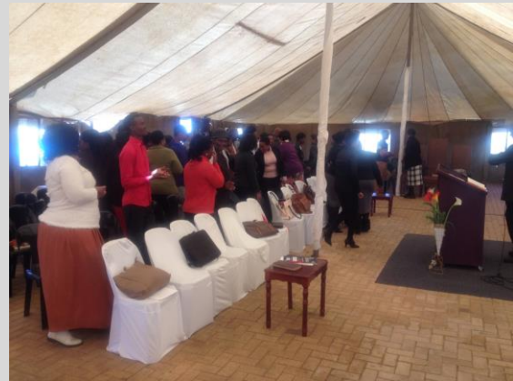
Preaching on missions in KwaThema