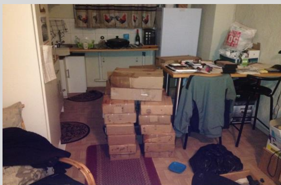
(We received loads of Gospel Booklets and Bibles from Frontline Fellowship)

In recent months, I have had some opportunities to preach at Birchleigh Baptist Church as well as at the NG Church Birchleigh as well as in NG Mondeor. If you want to listen to some of my preaching look under Word studies on this website www.interethnicmissions.net and under English sermons and Afrikaans sermons. These were great times of sharing the Word of God. God is keeping the doors open for me to share the His Word of God for which I am grateful. At NG Kempton Krui we are doing a monthly Bible Study this year on different topics. I sometimes lead the discussion. Our next Bible study is about: "Why is there 66 books in the Bible?" Why specifically the 66 that we have?