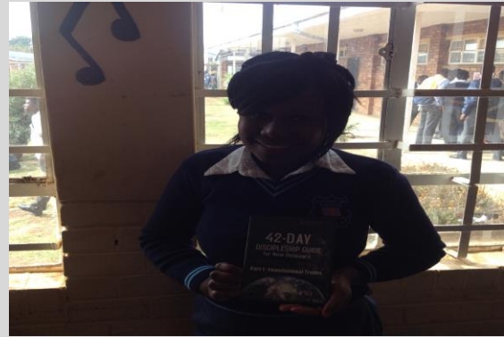
(Receiving a DVD! This student knew the 10 commandments by heart!)

The Gauteng Christian Action Group is hosting a Life-Chain on the 11 th of June again near Festival Mall. Please join us as we stand against this global and local Holocaust. Proverbs 31:8 says we must speak up for those who cannot speak for themselves. Evil only triumphs when good men and women do nothing! To keep silent in the day of evil is evil itself! William Wilberforce campaigned for decades to abolish slavery in the British Empire and succeeded. May we do the same concerning this modern day atrocity. I know many people have fought against abortion on demand much longer than I have! In the past three months, I have also conducted Bible studies on abortion at all the High Schools where I minister.